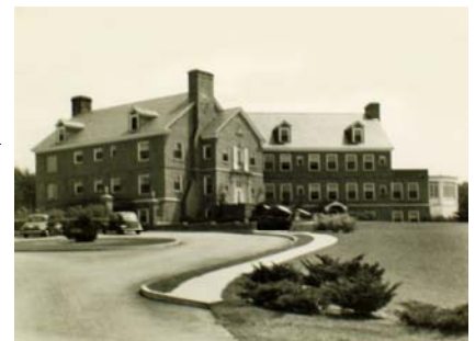
Frisbie Hospital Circa 1941