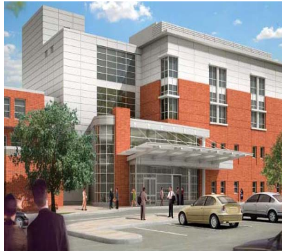
Frisbie after expansion is complete

Frisbie Memorial Hospital is a not-for-profit community hospital that evaluates and addresses the comprehensive healthcare needs of Rochester and surrounding communities. In response to these healthcare needs, the hospital coordinates, develops and provides high quality, affordable, preventive, educational, acute and chronic care services regardless of one's ability to pay. The hospital regularly seeks ways to improve the health status of the citizens of the communities it serves.